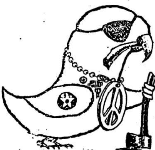
the small society

THE EVENING STAR Washington, D. C., Wednesday, December 10, 1969